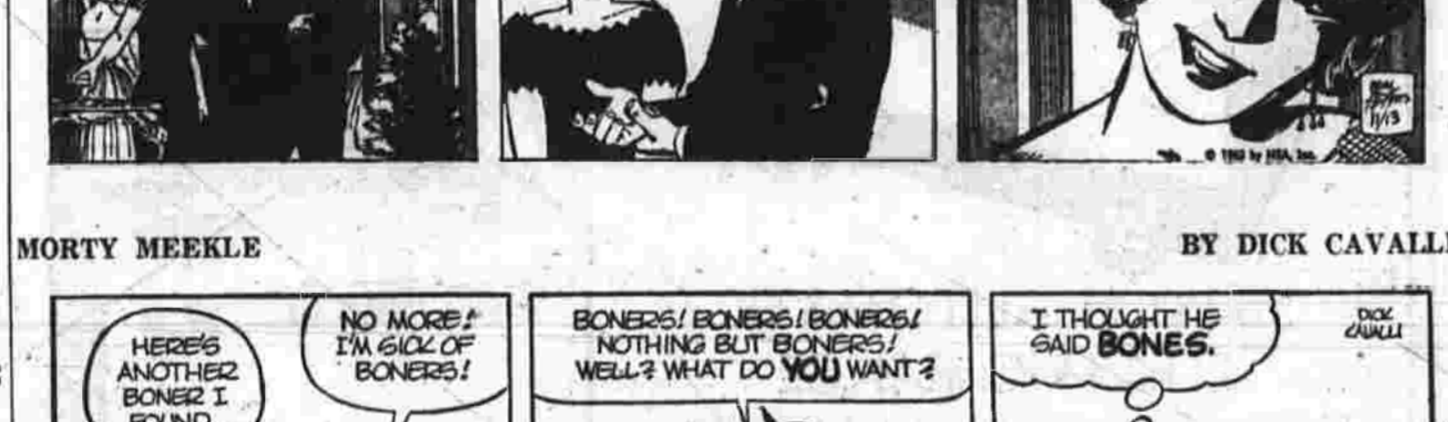
MORTY MEEKLE BY DICK CAVALLI