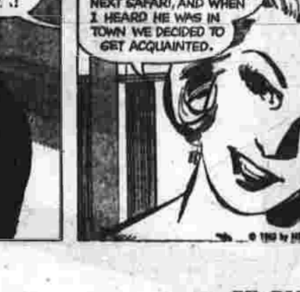
MORTY MEEKLE BY DICK CAVALLI