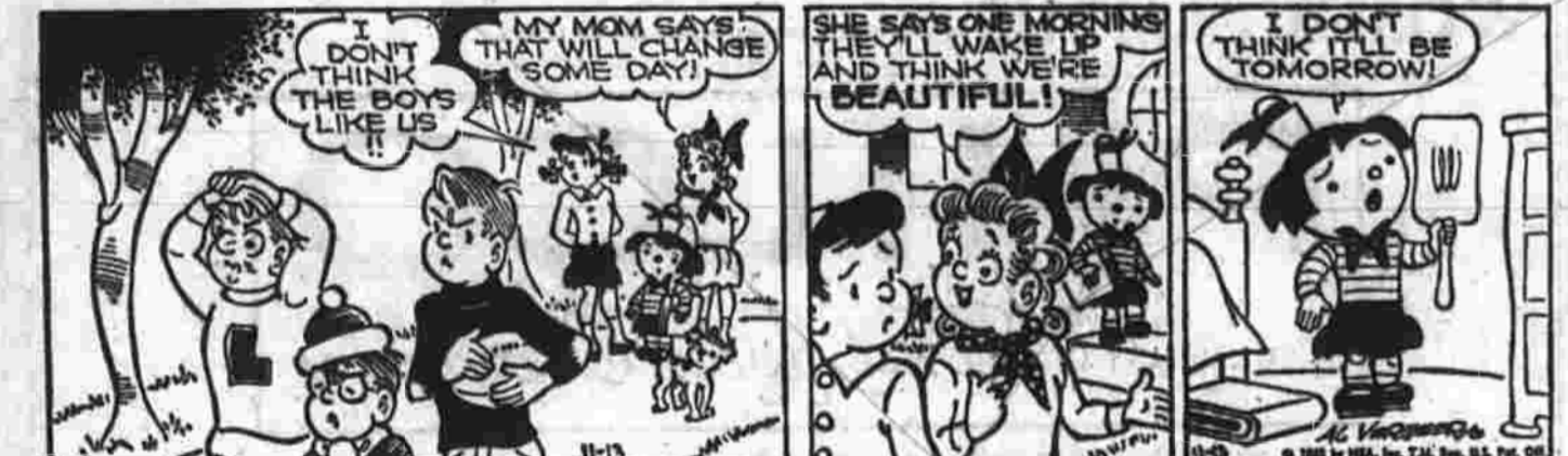
FRISCELLA'S POP BY AL VERMEER