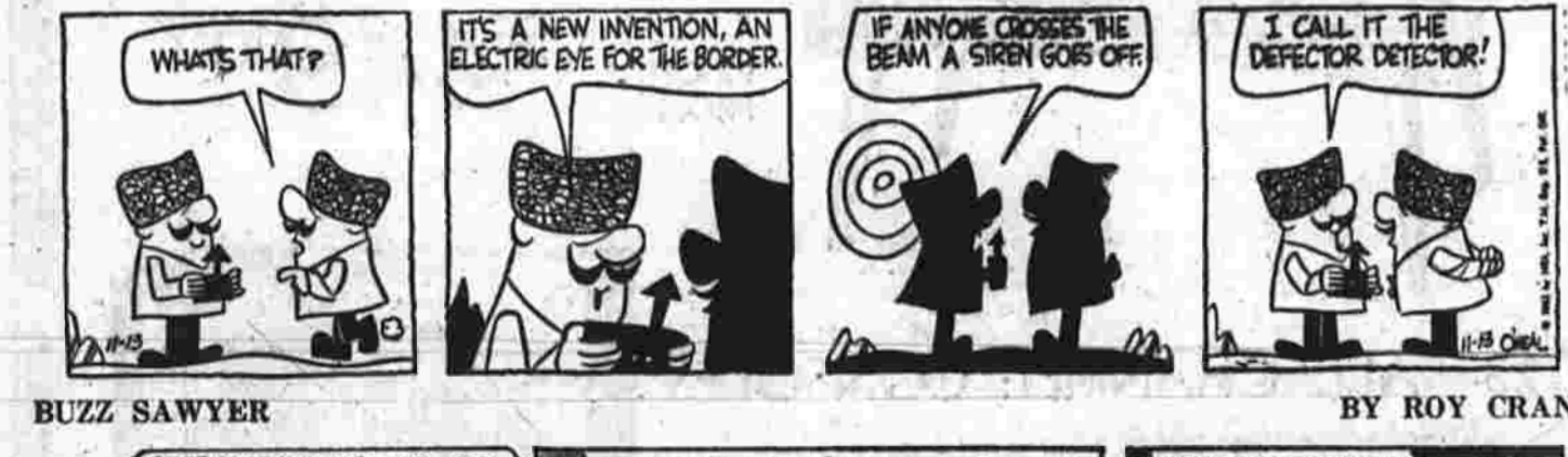
SHORT RIBS BY FRANK O'NEAL