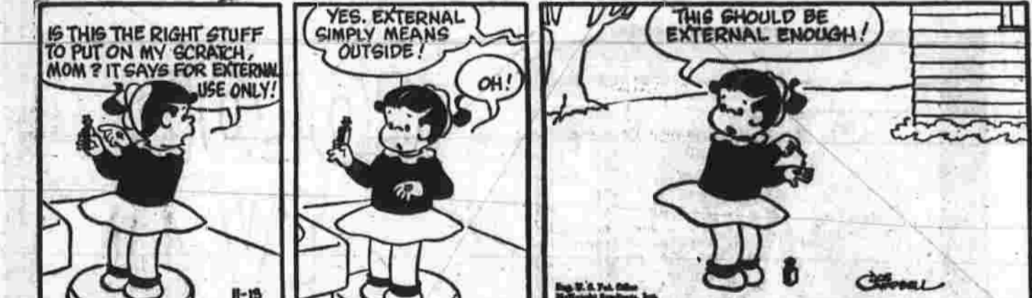
BONNIE BY JOE CAMPBELL