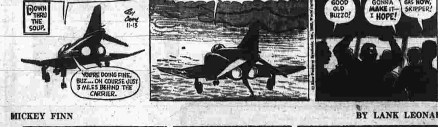
BUZZ SAWYER BY ROY CRANE