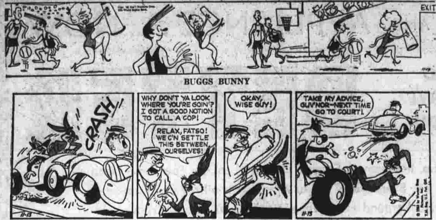
BUGGS BUNNY BY ROUSON